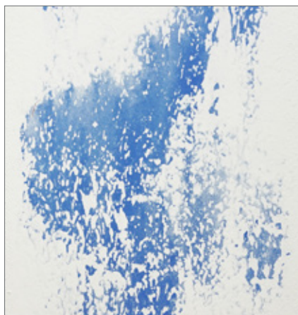
Finngard Silicone Allweather (left) versus standard façade paint (right) dried for 20 minutes at 2 °C and 90 %RH and then exposed to artificial rain.